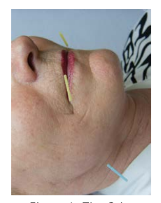
Figure 1: The Grin; Droopy Mouth

this expression is just beginning to be dissatisfied, and is not yet depressed, deeply unhappy or grieving.